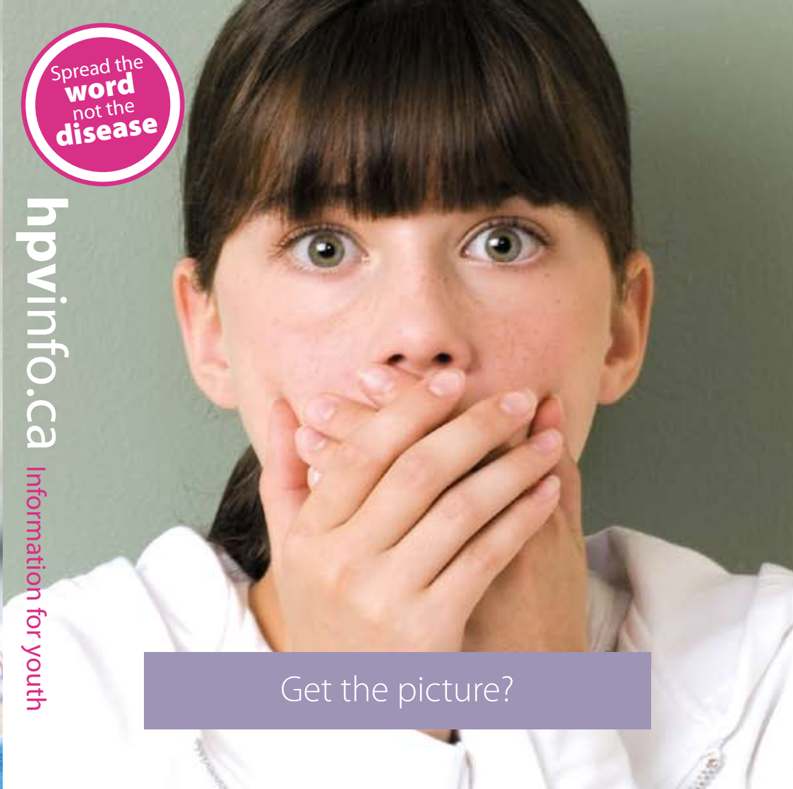
Get the picture?